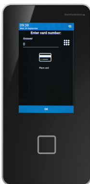
KABA TERMINAL 96 00

The dialogue is set up in ProMark and so it reflects the company's own language and terms. It can be managed per employee category for optimum data collection.