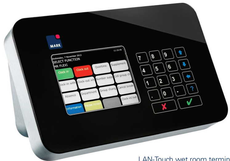
LAN-Touch wet room terminal

The terminals are equipped with 16 touch function keys which may be configured individually according to the company's requirements and the physical location of the terminals.